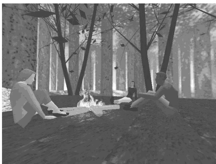
Figure 1: Forest scene depicting the campfire in the VE. Each member of the group tells a different HIV related story.

We developed a low cost, deployable desktop PC based system using custom software. The system implements a VR walkthrough experience of a tranquil campfire in a forest (Figure 1). The scene contains four interactive avatars who relate narratives compiled from counseling sessions with HIV/Aids patients. These narratives cover three aspects of HIV infection: receiving an HIV+ diagnosis, intervention, and living with an HIV+ status.