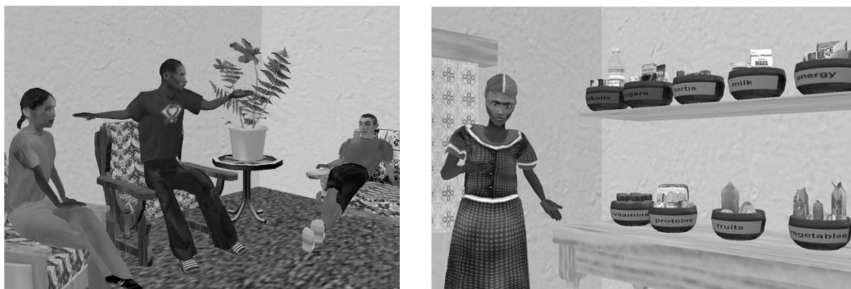
Figure 4: The Casual Support Group in the Lounge (left). Sandi (right) introduces food groups. Both scenes are interactive.

If the user enters the kitchen, she is greeted by an agent called Sandi. Sandi presents interactive areas where the user can explore the concepts of food groups, cleanliness and hygiene (Figure 4 below). Information presented in the kitchen was compiled primarily from Positive Health , a booklet distributed to HIV patients in South Africa [6]. Documents from the South African Department of Health [10] and United Nations Food and Agriculture Organization (FAO) [7] were also used.