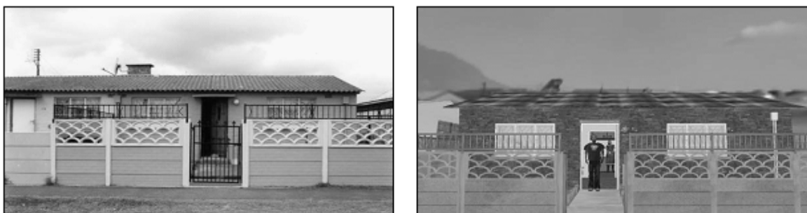
Figure 3: A typical council house (left) and the VE model derived from it (right). The figure in the doorway in the VE is Andile who greets the user.

The aim of this VE was to incorporate experiences gained in previous prototypes, while incorporating new material; we therefore chose an expandable design. We also wanted an environment users would find familiar (Figure 3). We designed a council house in which each of the rooms could be made to serve a different function and contain information and interactions corresponding to the activities that are associated with that room.